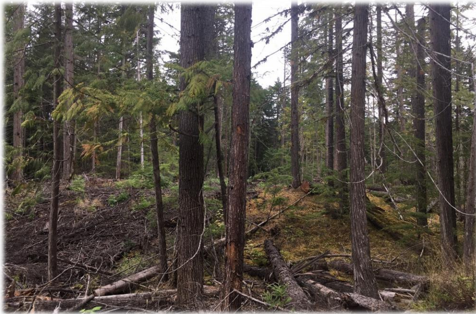
Figure 6. Partial cutting in ICH BEC zone. Cover photo: Partial cutting second growth in CWH BEC zone.