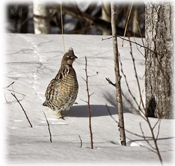
Figure 4. Ruffed grouse in winter.

Retaining snags and CWD are important for typical summer prey such as squirrels, woodpeckers, jays and thrushes. Retention and recruitment of high-quality snags is a critical structure for over 67 primary and secondary nesting and denning birds and mammal species in BC (Bunnell, 2012). Additionally, grouse and hares are critical winter food sources for the northern goshawk and have specific habitat needs.