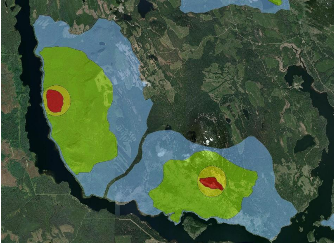
Figure 1. 4 zone territory management. Winter foraging (blue) area can overlap between territories.

Partial Cutting Defined for this Guidance: Partial cutting refers to any silviculture system that does not include a clearcut system and that does include rotational reserves. Examples of partial cutting silviculture systems include patch cut, seed tree, shelterwood, coppice, retention systems and selection systems. No matter what partial cut silviculture system is used, the retention requirements identified in Table 1 are necessary for suitable habitat structure.